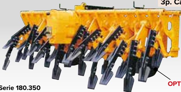
4516 Serie 180.350